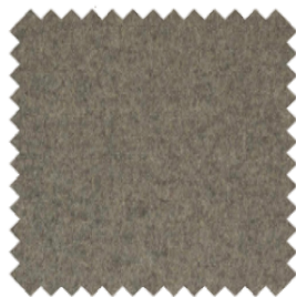
dolphin 180 (fr)