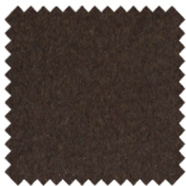
darkbrown 18 (fr)