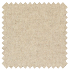
natural 01 (fr)