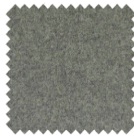
lightgrey 1000 (fr)