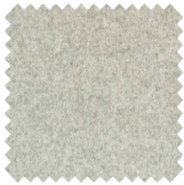
ashgrey 40 (fr)