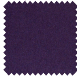
violet 72 (fr)