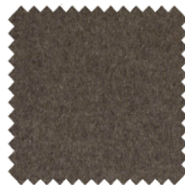
shitake 124 (fr)