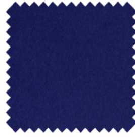
indigo 90 (fr)