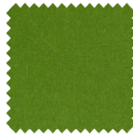
pistachio 52 (fr)