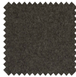
middengrijs 1001 (fr)