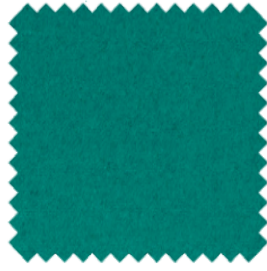
aqua 143 (fr)