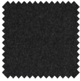
anthracite 67 (fr)