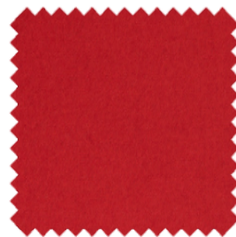
fire 139 (fr)

Please note: colours may vary according to your screen settings.