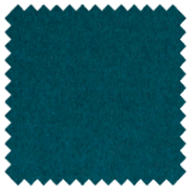
petrol 56 (fr)