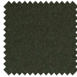
olive 53 (fr)