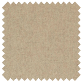
beige 1037 (fr)