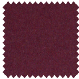
aubergine 74 (fr)