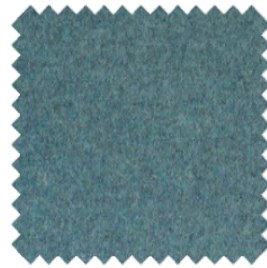
azure 144 (fr)