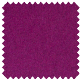
prune 76 (fr)