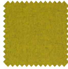
yellow 24 (fr)