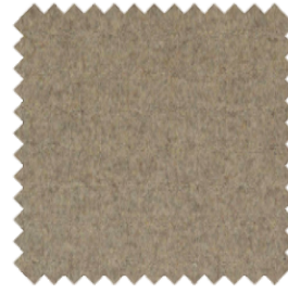
kiezel 7 (fr)