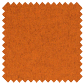
mandarin 129 (fr)