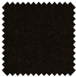
zwart 1003 (fr)