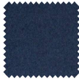
blue 45 (fr)