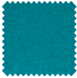
oceanblue 147 (fr)