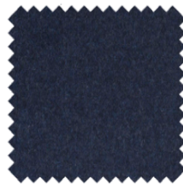
navy 1007 (fr)