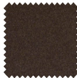
taupe 1008 (fr)

Please note: colours may vary according to your screen settings.