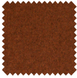
terra 31 (fr)