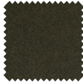
army 14 (fr)