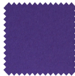
nightshade 178 (fr)

Please note: colours may vary according to your screen settings.