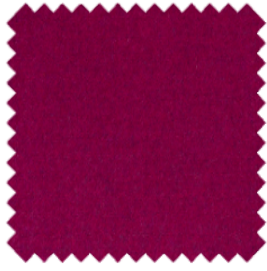
fuchsia 77 (fr)