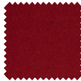
red 2011 (fr)