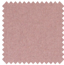
blossom 166 (fr)