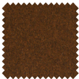
rust 29 (fr)