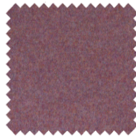
pink 73 (fr)