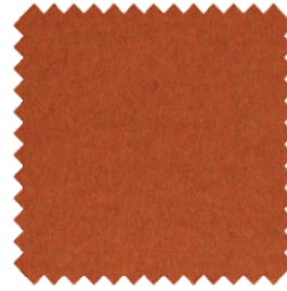
orange 2012/b (fr)