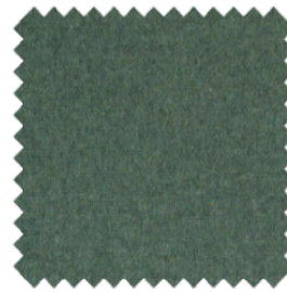
mint 50 (fr)