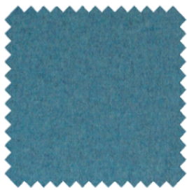
lightblue 41 (fr)